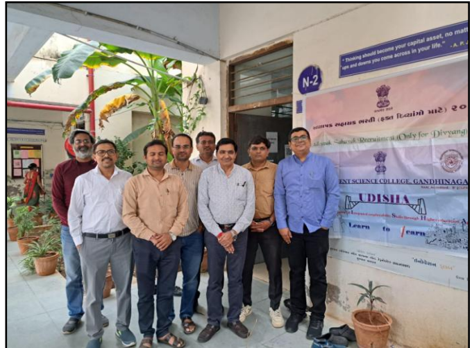
Team UDISHA after completion of Placement Drive