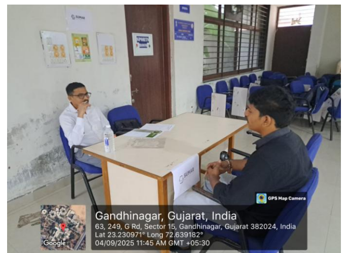
Interview: SUMAR Biotech LLP