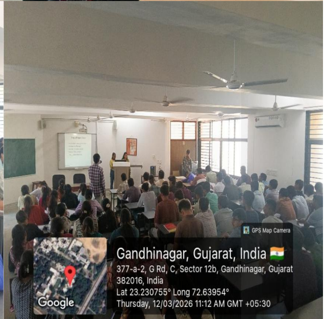
Gandhinagar, Gujarat, India 🇮🇳 377-a-2, G Rd, C, Sector 12b, Gandhinagar, Gujarat 382016, India Lat 23.230755° Long 72.63954° Thursday, 12/03/2026 11:12 AM GMT +05:30