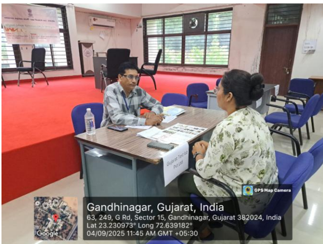
Interview: Gujarat Test Labs Pvt. Ltd.