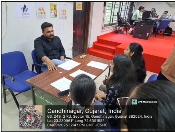
Interview: LBA Labs