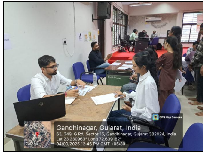
Interview: CESS Controls