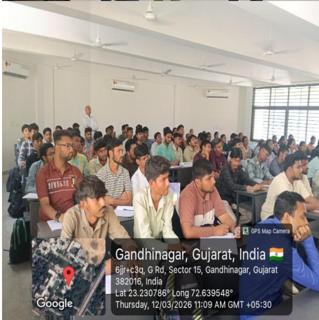
Gandhinagar, Gujarat, India 🇮🇳 6jjr+c3q, G Rd, Sector 15, Gandhinagar, Gujarat 382016, India Lat 23.230786° Long 72.639548° Thursday, 12/03/2026 11:09 AM GMT +05:30