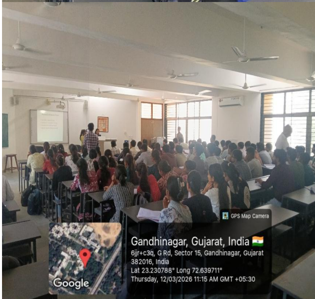
Gandhinagar, Gujarat, India 🇮🇳 6jjr+c3q, G Rd, Sector 15, Gandhinagar, Gujarat 382016, India Lat 23.230788° Long 72.639711° Thursday, 12/03/2026 11:15 AM GMT +05:30