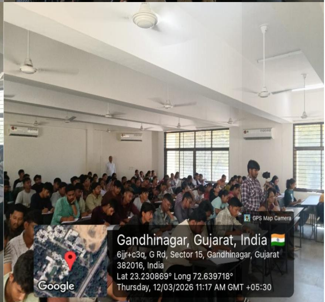
Gandhinagar, Gujarat, India 🇮🇳 6jjr+c3q, G Rd, Sector 15, Gandhinagar, Gujarat 382016, India Lat 23.230869° Long 72.639718° Thursday, 12/03/2026 11:17 AM GMT +05:30