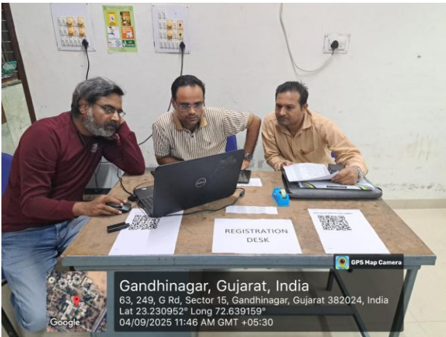
Registration and Welcome Desk