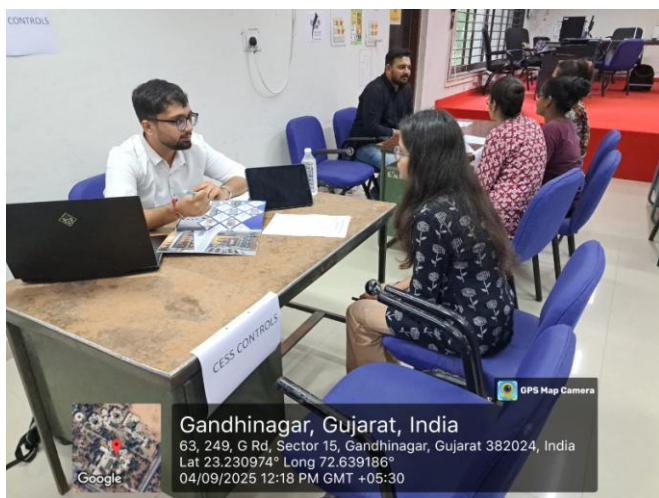
Interview: CESS Controls