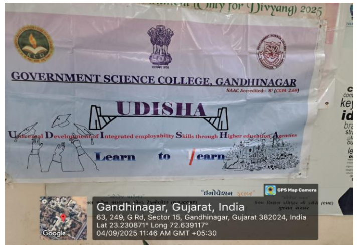
UDISHA-Placement Initiative Poster