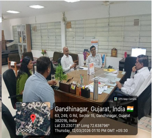
Gandhinagar, Gujarat, India 🇮🇳 63, 249, G Rd, Sector 15, Gandhinagar, Gujarat 382016, India Lat 23.230778° Long 72.638796° Thursday, 12/03/2026 01:10 PM GMT +05:30