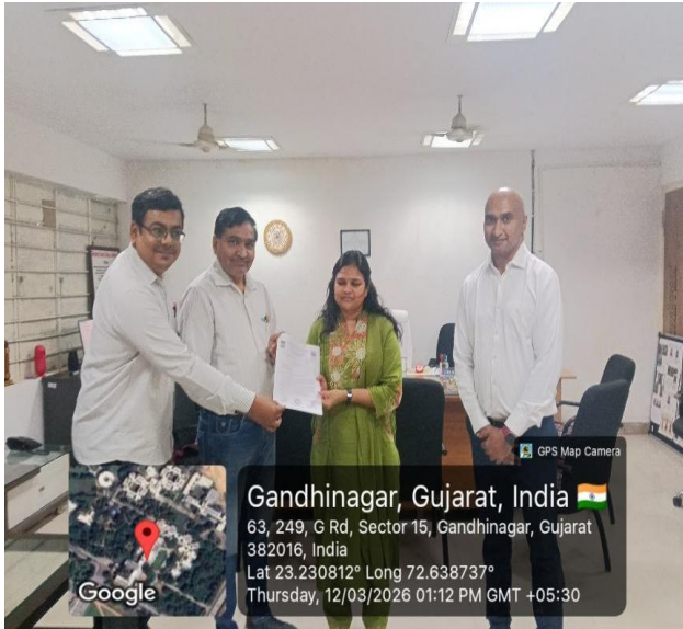
Gandhinagar, Gujarat, India 🇮🇳 63, 249, G Rd, Sector 15, Gandhinagar, Gujarat 382016, India Lat 23.230812° Long 72.638737° Thursday, 12/03/2026 01:12 PM GMT +05:30